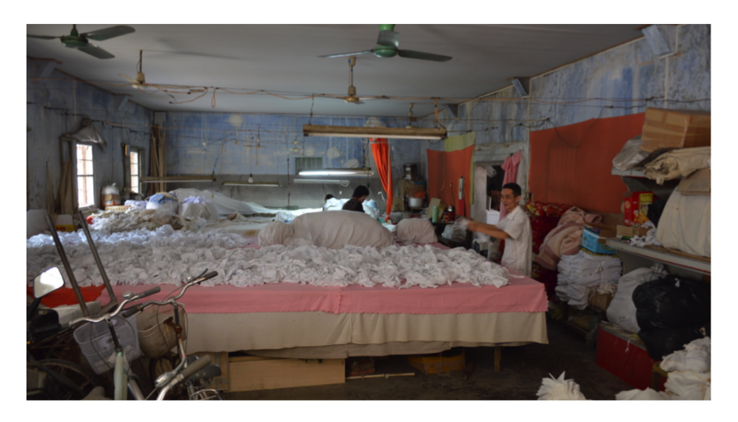
Research in the local embroidery industry, Chaoshan region.