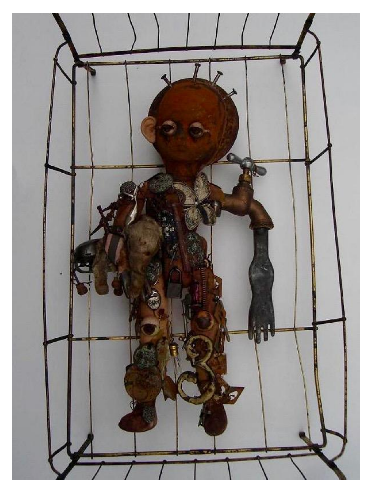
Rust Belt Baby.