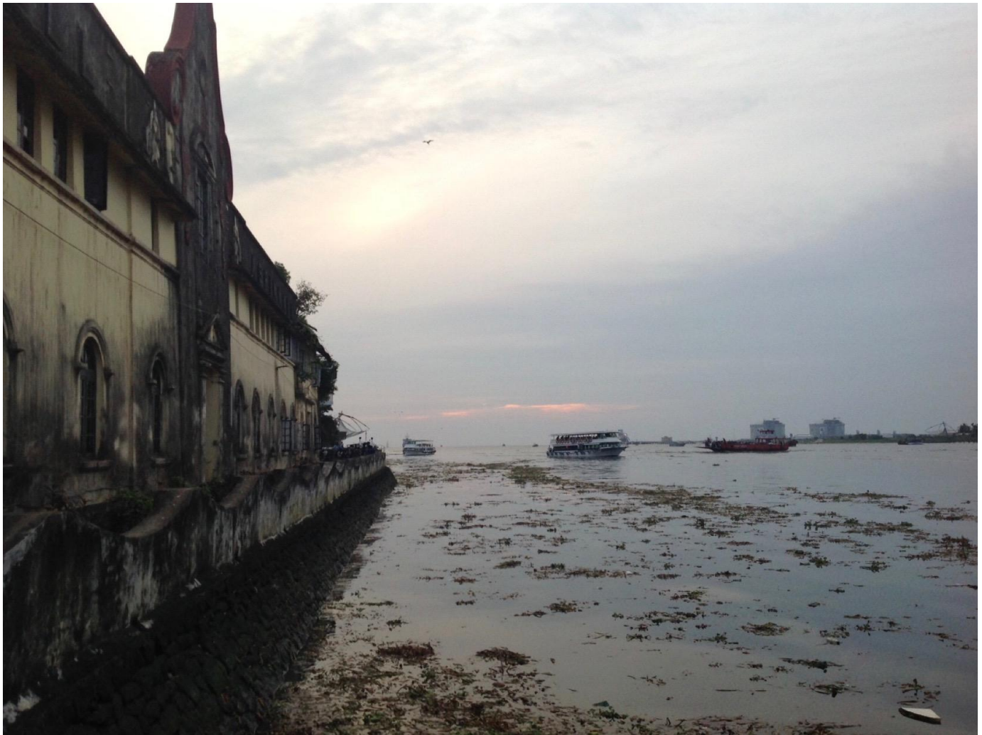
Image 2. Aspinwall House, Kochi.

The KMB takes place not far from Calicut (Kozhikode) where the historical encounter occurred, and is embedded in the city of Kochi where Vasco Da Gama died. 6