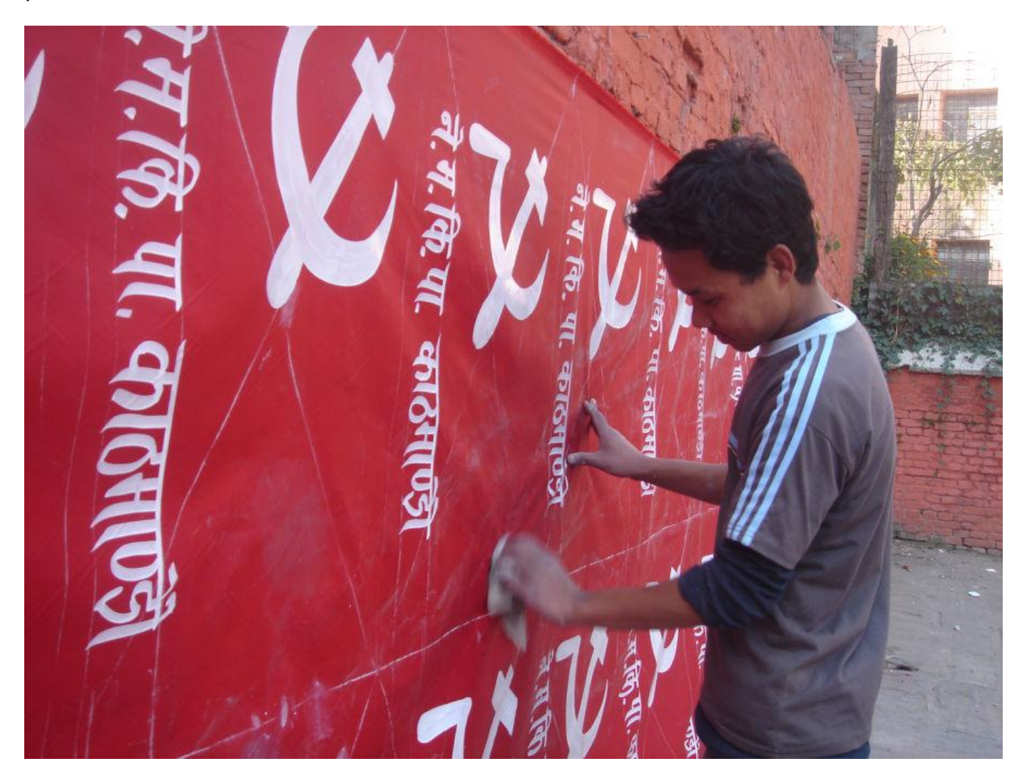
Thamel, Nepal, 2008.

The Soviet Union ultimately became too bureaucratic, with extreme organization of the economy and strict limits on the freedom of individuals to write and publish, so that there was no political opposition to challenge the policies of the government. It over-spent, extended itself economically, and therefore its economy was greatly weakened. These weaknesses resulted in the disintegration of the Soviet Union in 1991—a heart-breaking demise but one that made me more realistic about what is possible and what is not.