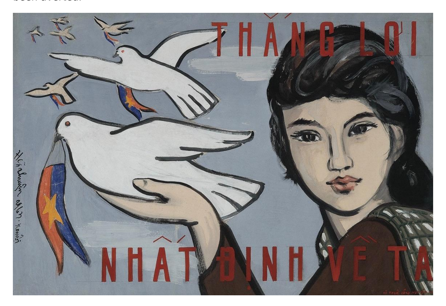
"Victory Will Be Ours."

Had the United States continued to build on war-era trust with the Soviet Union, one wonders if the Cold War, the arms race, and other forms of confrontation could have been averted.<sup>2</sup>