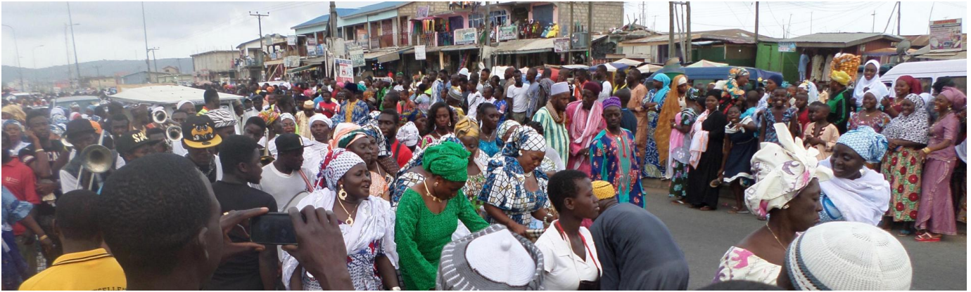
Eid Al-Fitr parade welcomes chiefs from 18 tribes — Ghana, 2015

As far as Wiredu's notion of consensus goes, engagement does not aim at a dash for actual arrival at some preconceived destination marked by a symmetrical synthesis, or worse still a hierarchical assimilation of disparate views. Community building does not require unanimity. What he does propose is constant endeavor toward a common goal, and participation in forging this common goal and each other's aspirations and lives. Consensus urges co-participants in community to trust in their capacity to bridge their differences, and to believe that doing so is better for them collectively than remaining indifferent and immobile in their thinking that we are justified in living socially isolated lives.