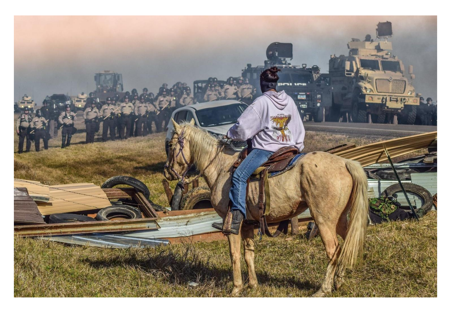
Standing Rock Sioux protest against Dakota Access oil pipeline.

So is there an alternative to a global new war? Can we tell a new story that would enable us to imagine new or reformed institutions that could counter rather than win wars? Such a story would need to be relevant for a global, resource saving, socially just model of development based on information and communications technologies. Writing in 1939, the historian E.H. Carr drew a distinction between utopia and realism in International Relations. Utopians propose various international schemes for world peace. Realists analyze the world in terms of states and the military and economic power they possess. Carr argued that the Utopians of the inter-war period had failed to take realism into account even though the realists often found it necessary to clothe their power in utopian language in order to exert power. I think the opposite is the case today. Utopianism, the construction of effective global institutions, is the only realistic option. Putin and Trump clothe their actions in the language of traditional realism (statism and sovereignty) and this can only lead to war and violence. The only way to address the problems that we face today is through a new or reformed set of institutions at international or global and local