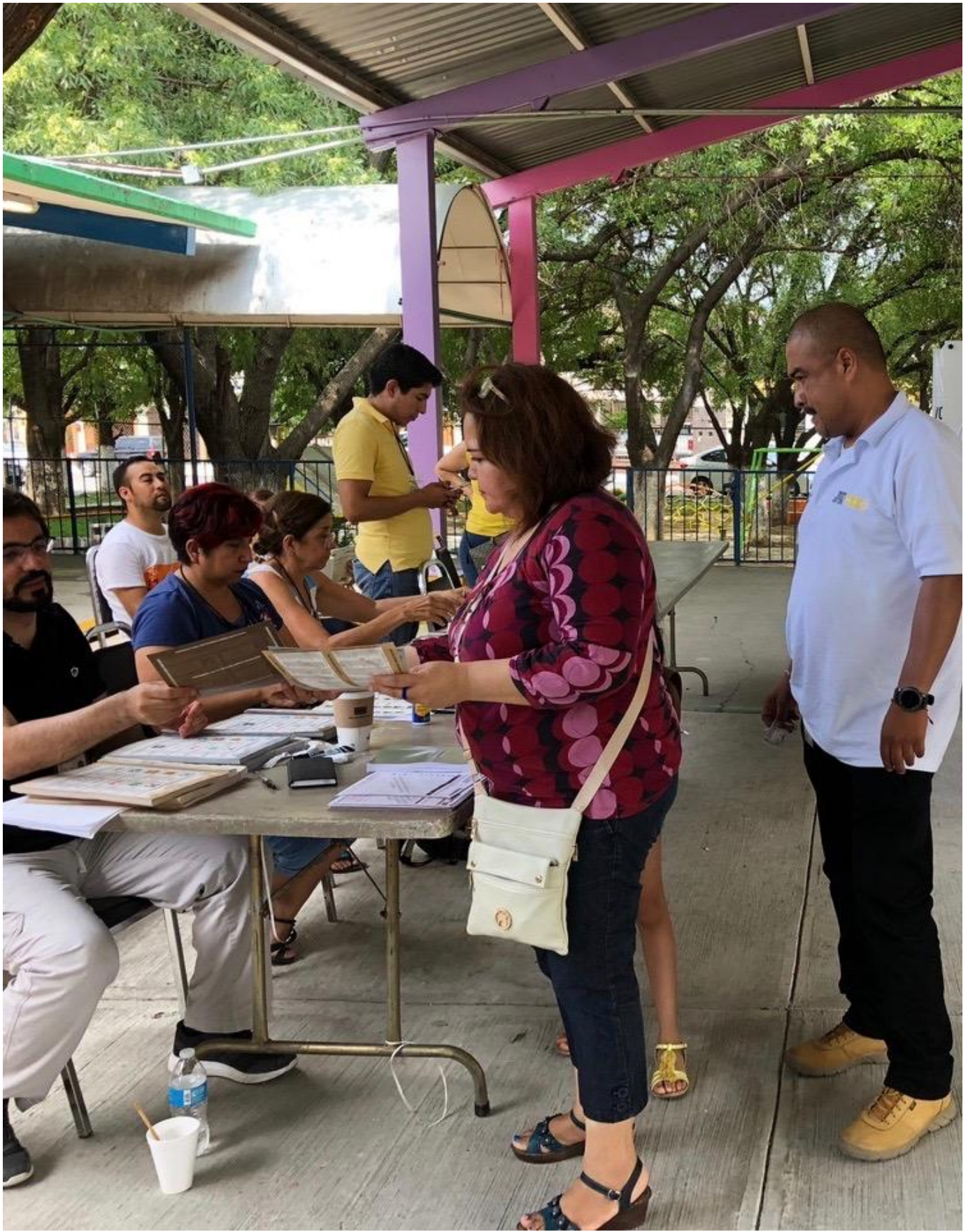
Voters at polling station in Mexico, 2018.