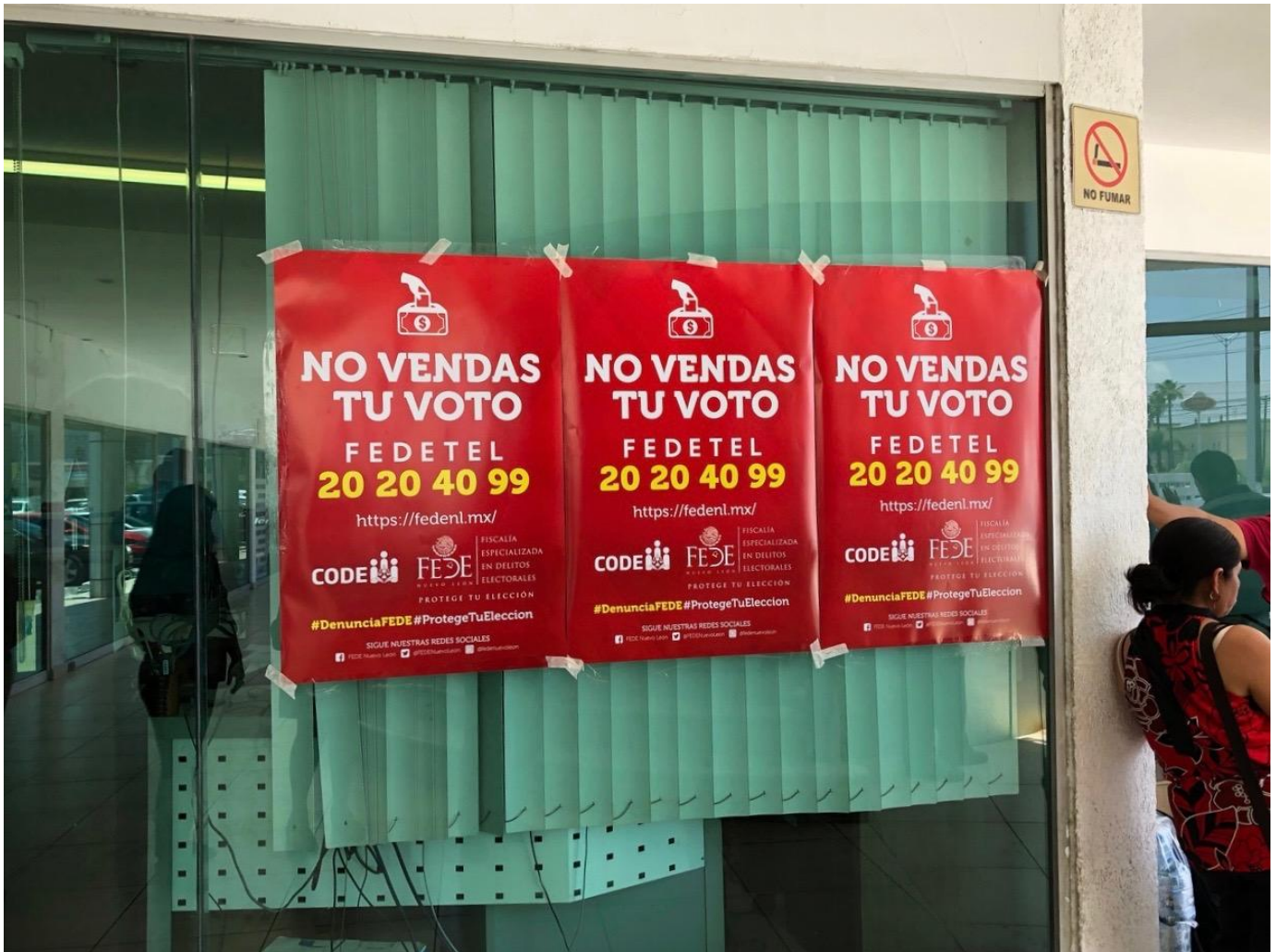
'DO NOT SELL YOUR VOTE' -- 2018 Mexican election posters.