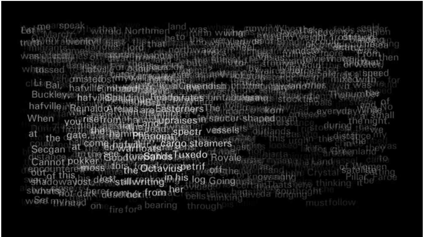
Image still from Caroline Bergvall (with Thomas Köppel), 'Seafarer', 2014. DRIFT exhibition, 2015. Image source

which we think we know the world. Poetry makes of one's own language a foreign country—which is always strange, and in which meaning is always provisional, relational and contested—and in this way inhabits translation as a normative mode. It offers us, as citizens of a now global world, keys to help recast the manner in which we approach difference, diversity, and foreignness itself.