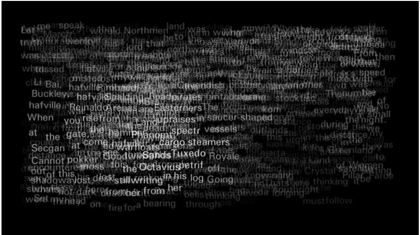
Image still from Caroline Bergvall (with Thomas Köppel), 'Seafarer', 2014. DRIFT exhibition, 2015. Image source

which we think we know the world. Poetry makes of one’s own language a foreign country—which is always strange, and in which meaning is always provisional, relational and contested—and in this way inhabits translation as a normative mode. It offers us, as citizens of a now global world, keys to help recast the manner in which we approach difference, diversity, and foreignness itself.