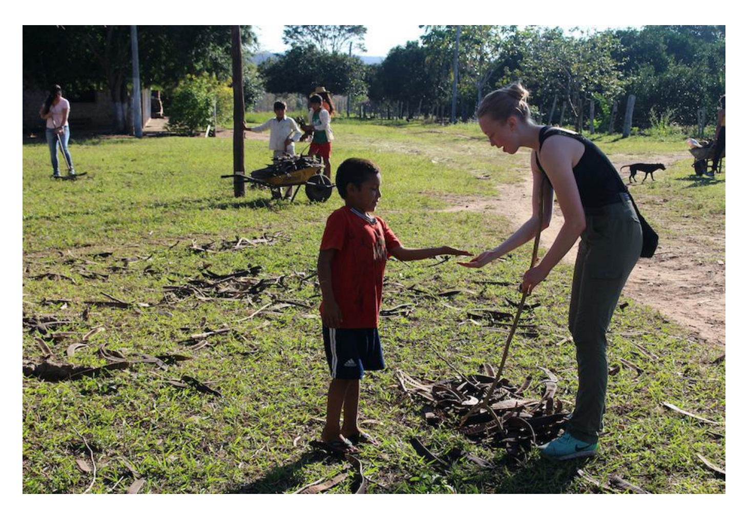
American students participate in an environmental justice program in Bolivia.

Climate change is only one example where negative global circumstances have contributed to positive relational dynamics between AGX students and placement hosts. It is here that a sense of mutuality can help the student to transcend barriers such as those imposed by neoliberal socio-economic frameworks that pit communities against each other in a race towards scarcity. Students can and do recognize a common perspective with their hosts in assessing culpability for the calamitous condition of the globe's current state. And they observe the impact of globally unjust structures that benefit some at the expense of others. In other words, they learn to understand that global relationships can only be ethically fostered when socio-economic relational structures are also just.