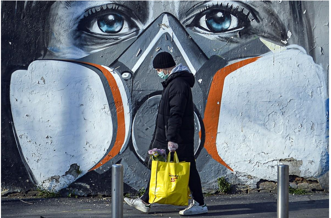
A man walks with his groceries past a coronavirus-inspired mural in Milan, Italy.

In South Korea, the outbreak in a church in Daegu in late February led to a miles-long queue of people seeking masks. Korean health workers were soon in full protective gear as they provided coronavirus testing at newly set up drive-through stations. These governments emphasized public information and provided daily reports for confirmed cases, and traced down patients' close contacts and the routes of the virus's spread. 7 A government website in Hong Kong, for example, provided updates on infections and suspected cases along with other important information.