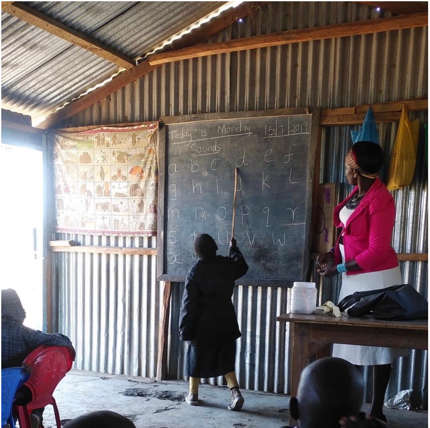
Child learning the alphabet in Pre-primary classroom.