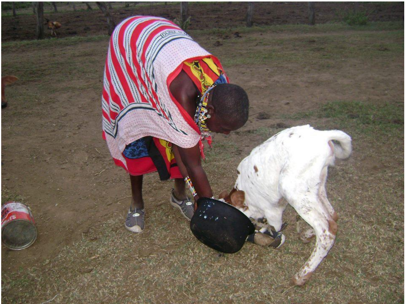
A Maasai woman taking care of a wounded goat.

So, from the perspective of Maasai parents in Narok, pre-primary education is regarded as the development of learning foundations for young children. Meanwhile, the Kenyan government has set up the aim of the pre-primary education to be children's holistic development, as aligned with global goals tied to sustainable development. My interviewees' comments show that many unschooled parents of young children in Narok understand the role and purpose of pre-primary education, yet the significance of culture and tradition of the Maasai is still prevalent in their views about child-raising and expectations about academic-based teaching.