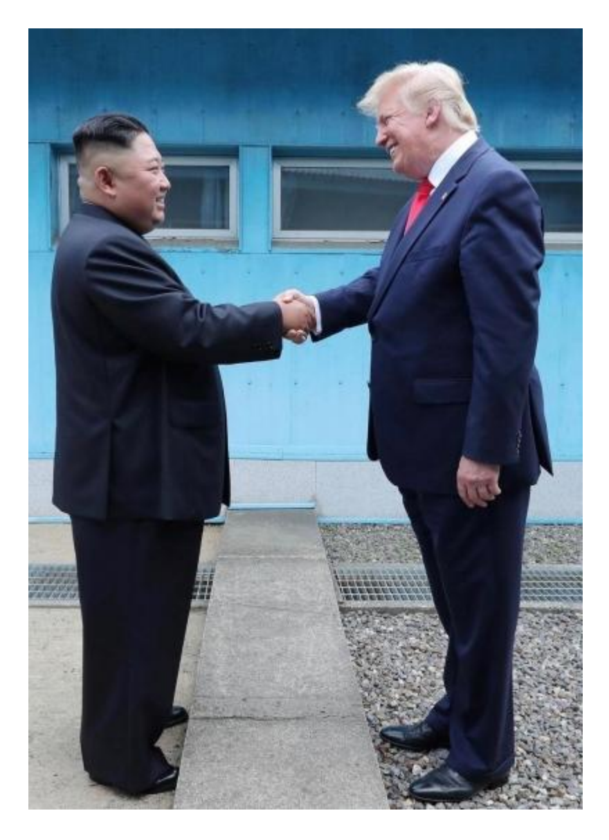
Donald Trump met Kim Jong-un in the Demilitarised Zone on June 30, 2019.

What matters most, going forward, will be a capacity to wage bewilderingly complex struggles of "mind over mind," not just ad hoc or satisfyingly visceral contests of "mind over matter." In time, such critical strategy lessons could apply usefully beyond the specific North Korean nuclear issue. Again, the world is always a system; what happens at one place may impact variously assorted other places and corresponding outcomes.