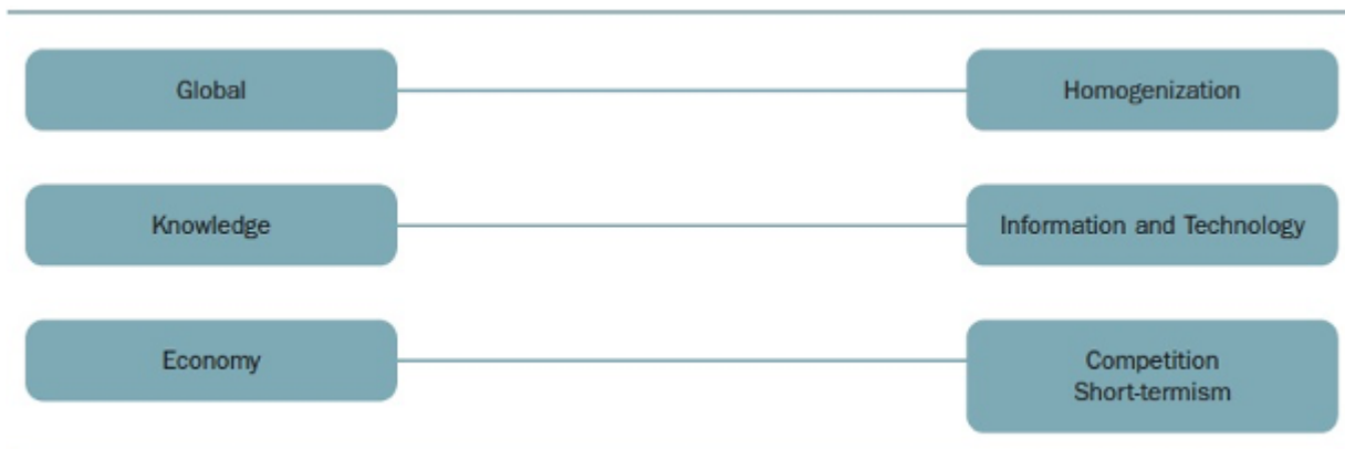
Figure 1: Global Knowledge Economy <-> Neoliberal Globalization

While the old-paradigm, industrial-era thinking of the knowledge economy still dominates the higher education discourse, this economistic framing misses the richness and diversity of knowledge creation emerging on a planetary scale.