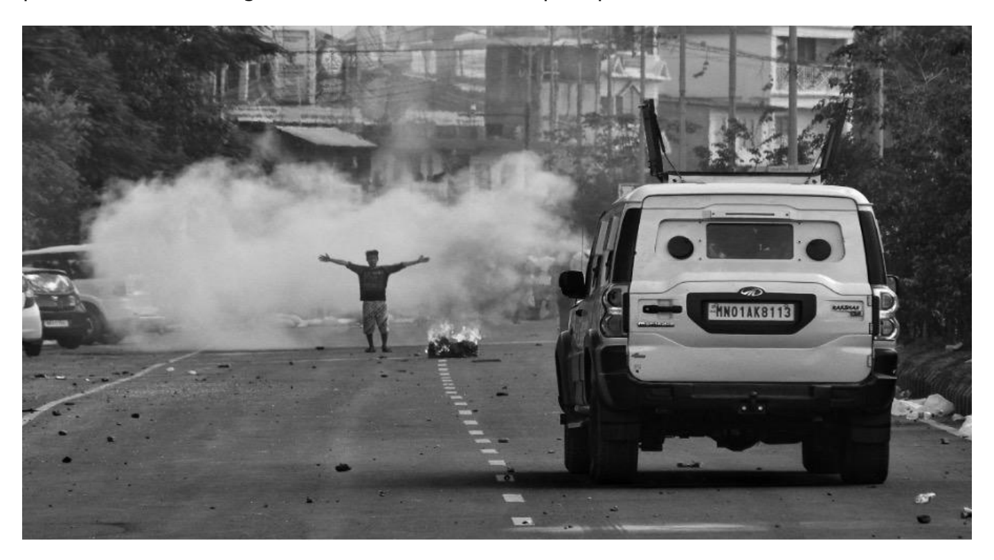
A protester facing an armored vehicle in Manipur on September 27,2023. (Photo: Robinson Wahengbam).

status in India until it gained full statehood in 1972 with an elected government (Soyam, ibid.). In response, several political movements emerged seeking the restoration of the popular government in Manipur. A notable example is the Revolutionary Nationalist Party (RNP), that initiated a campaign in 1953, but was swiftly suppressed through a sedition case, marking as one of the first such in post-independence India. The 1960s saw the establishment of the Meitei State Committee, and the United National Liberation Front (UNLF), the latter advocating for a socialist sovereign Manipur. At the moment, numerous armed groups have proliferated resulting into one of the most complex political conflicts in South Asia.