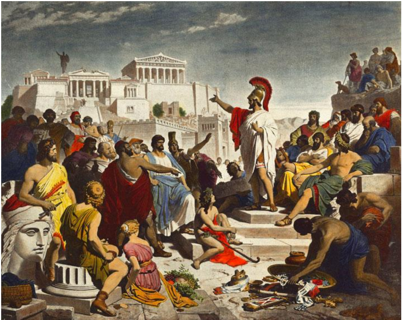
Pericles' Funeral Oration, by Philipp Foltz (1852).

The technical capacities of citizenship have been accumulating for some time. The equivalence of citizenship and political agency, for instance, was constituted by the Greeks, who, in Engin Isin's words, began the tradition of granting the citizen "the right to being political." It is in this often idealized Classical world where we find the first version of a tension of values between racial nativism and inclusive emancipation.