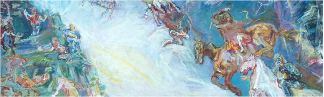
Oskar Kokoschka, Prometheus Triptych (1950); central panel 'Apocalypse'

of the world. There is a New Jerusalem of “clean water for all,” of “no more tears”... And it is the most dire of the ancient visions of warning.