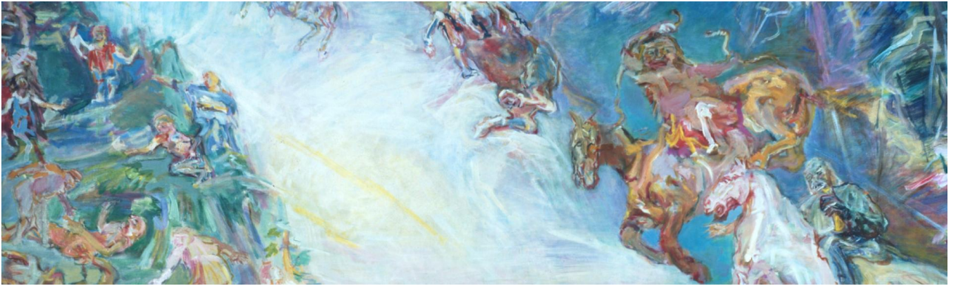
Oskar Kokoschka, Prometheus Triptych (1950); central panel 'Apocalypse'

of the world. There is a New Jerusalem of “clean water for all,” of “no more tears”... And it is the most dire of the ancient visions of warning.