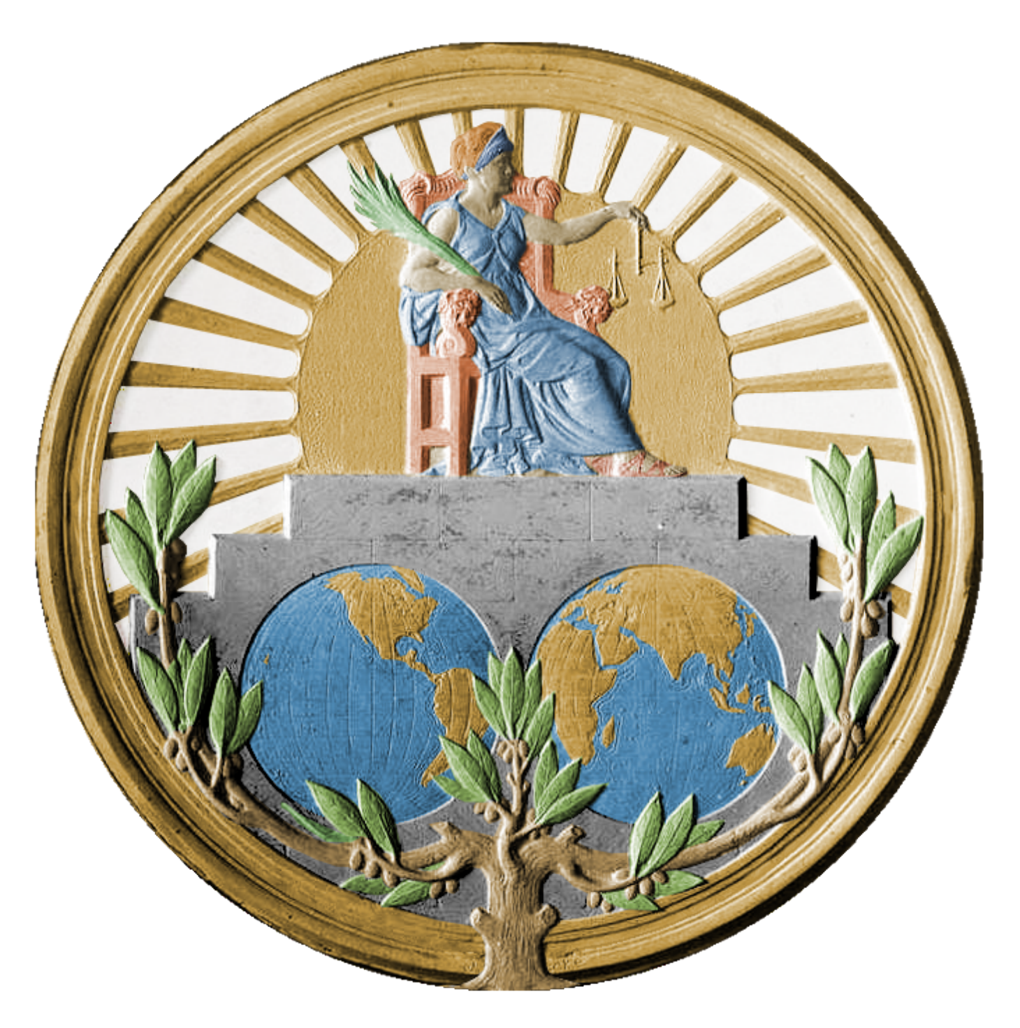
Seal of the International Court of Justice