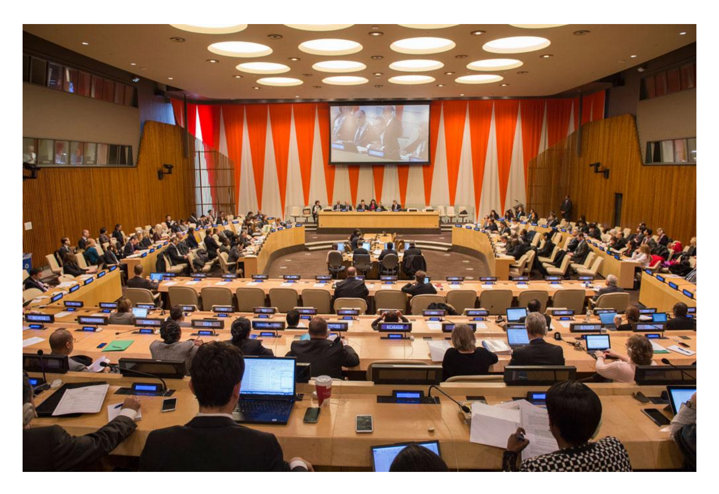
UN Economic and Social Council (ECOSOC)

Similarly, strengthening bodies like the Peace Building Commission and ECOSOC (UN Economic and Social Council) and giving more power to organs that deal with sustainable development and human rights would be welcome changes. Even evolutionary steps in relation to informal groups such as the G-20—designated by U.S. President Barack Obama as the main forum for coordination of economic policies—may have positive effect on decisions that affect the whole world. Arguably, with some adjustments, such as a better representation of African nations, the G-20 might have its agenda expanded to subjects other than financial ones. None of these reforms, however, would in and by themselves avoid the threats posed by narrow self-centered attitudes. There would be no guarantee that, even with improved governance structures, questions of transcending importance such as total nuclear disarmament (the only way, in my opinion, to ensure sustainable nonproliferation) or combatting climate change, which are posed in Richard Falk's " Response," would receive the treatment they deserve by changes, however positive, in the structure and composition of international bodies. No "structural reform" would have the magical power of preempting the rise of conservative nationalist