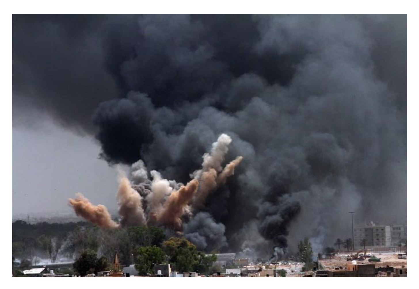
Tripoli, Syria - 2011.

During my years as foreign minister, both president Lula<sup>7</sup> and I stressed the importance of solidarity , starting with our own neighbors but also extending to other countries of the Global South. To rebut the criticism of this initiative from most of the Brazilian media and a large portion of our ruling elite, I argued that "generosity" (a term that normally has no place in realist analyses and which, I concede, is often misused or manipulated) consists in looking at one's own interest in the long run. Without this kind of perception, I do not see how we can get rid of the short-termism and the pursuit of narrow interest denounced by Davutoğlu. Political education—or appropriate public information—is a task that requires bold actions, and not very popular ones, at the national as well as the international levels. Davutoğlu's insistence on broader participation of individuals and groups of individuals over and above nation states may be an important way of encouraging the development of the kind of solidarity and long-term perspective that the world needs.