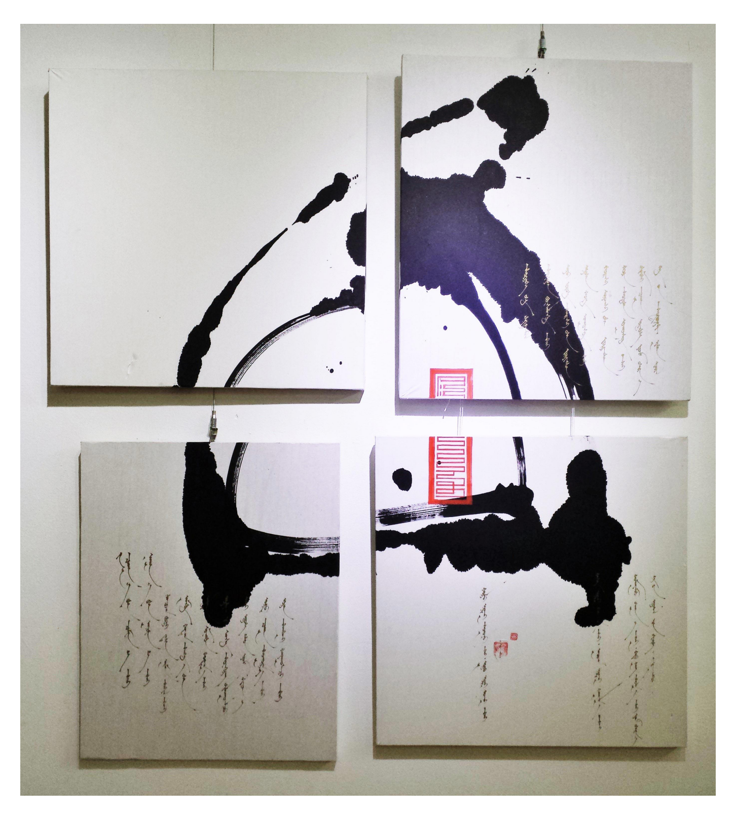
Mongolian calligraphy

This modular approach extended into statecraft—there was little that was discernibly "Mongol" within the group's larger structure. While the group was known for their brutality in wartime, in many cases, they allowed conquered groups to