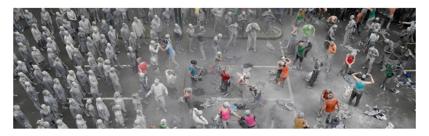
<u>1000 Gestalten</u> performance-protest ahead of G20 summit in Hamburg, Germany, August 2017.

The very notion of war has shifted into more structural terrains: structural war involves the use of military and structural power to inflict structural (and cultural) violence. It erects or enforces unjustifiable global inequalities, including the various forms of inequality long patrolled by liberal and neoliberal governmentality. Structural war has given rise to new digital forms of governmentality, dependent on 'atmospheric' forms of power. They are networked, remote, automated, and more intensely hierarchical than ever before. It is aimed more broadly at disabling the recent critical shifts that have been occurring towards a system of global justice.