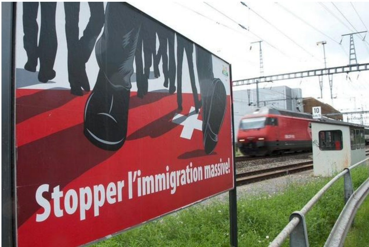
Anti-immigration campaign poster, Switzerland

Still, until now, within Western Europe, democratic institutions have proven robust enough to prevent populist attitudes from growing into authoritarian regimes. And it seems that citizens do not really wish to change constitutional rules. The populist vote could also be interpreted as a sort of “menace card” that citizens insert into the ballot box to achieve better responsiveness from incumbent political parties. However, even if the recourse to populist parties is instrumental and carried out within the boundaries of democratic rules, their existence is already hurting the quality of democracy. Many populist political programs, in fact, are soaked with nationalistic and xenophobic rhetoric that so far has eroded but not destroyed democratic institutions. Right-wing populism is often associated with rallies and political provocations against migrants, minorities, gypsies, or LGBTQ citizens; this decreases civil liberties and security, and therefore corrodes political life.