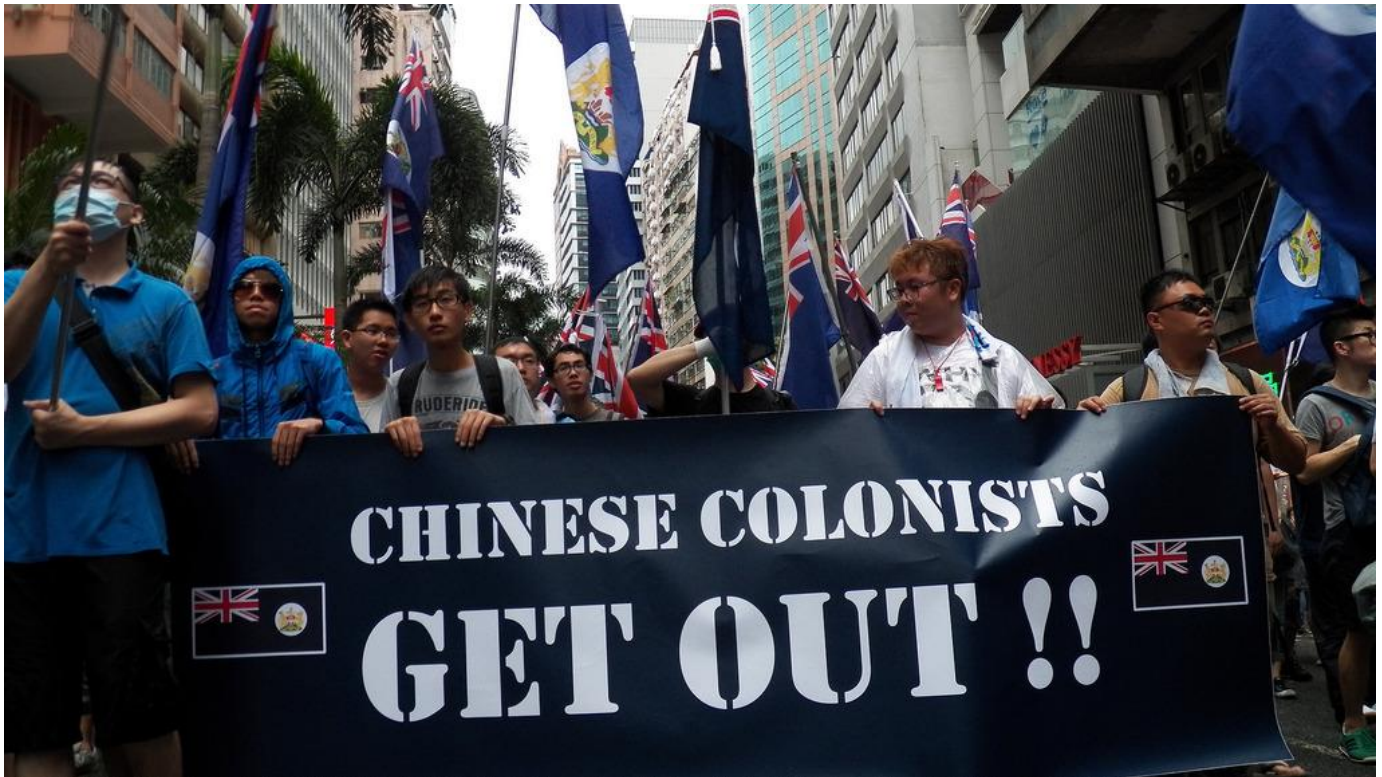
Pro-independence protestors carry colonial Hong Kong flags, July 2013

The conservative criticisms have raised a number of interesting questions concerning the relationship between liberalism and colonialism. I think that these criticisms will be adequately dealt with only when the liberals go beyond merely invoking liberalism as moral values, and delve deeper into the entangled and contradictory historical involvement of liberalism in colonialism.