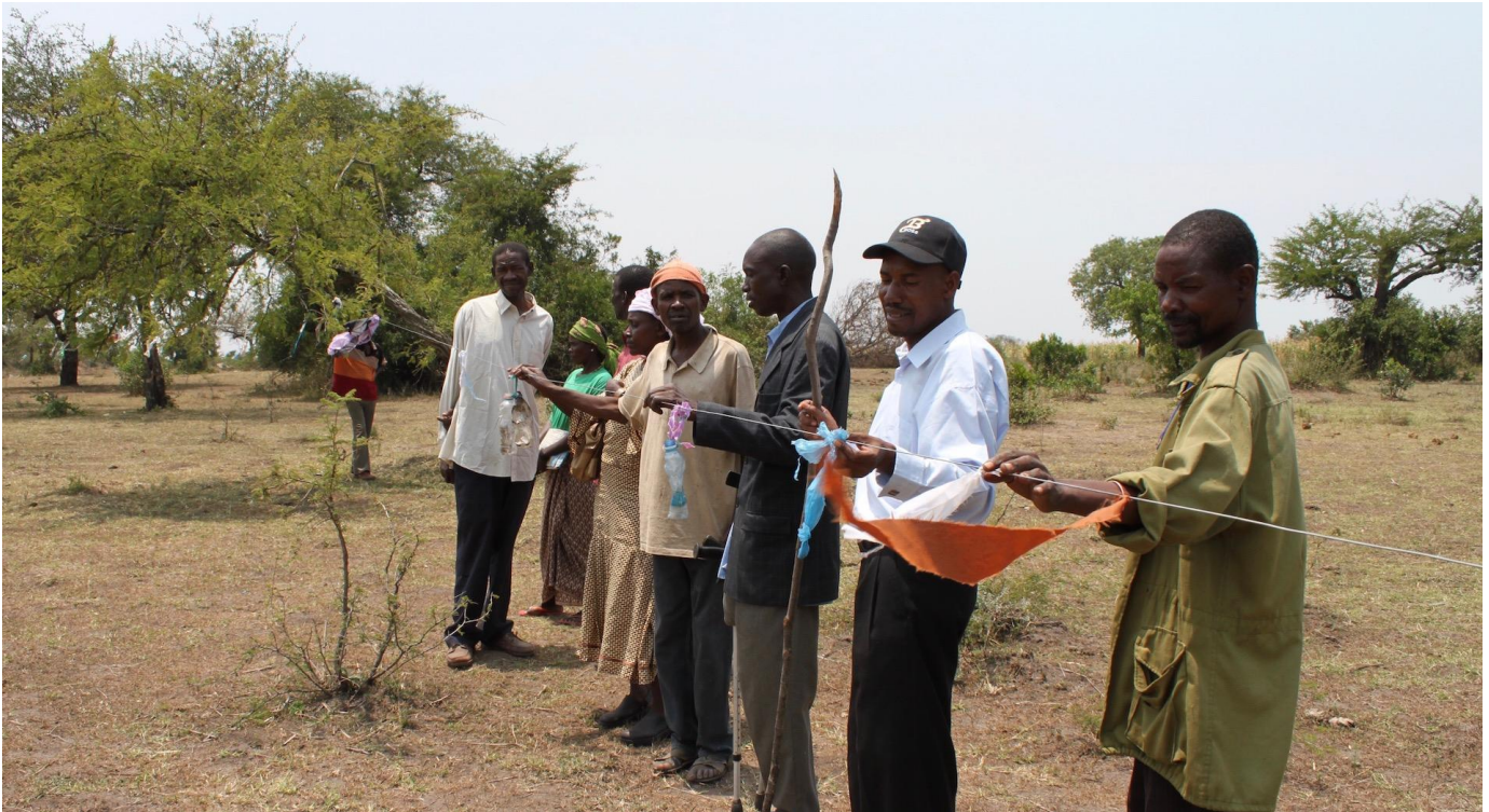
Figure 5: villagers tie strips of colored cloth to wire fence.

In this way, Village A has managed to somewhat reduce crop damage in the last three years. However, elephants are smart and capable of learning; they can adapt to the countermeasures people create if they are in use for too long, forcing villagers to explore other measures to protect their fields from elephant raiding.