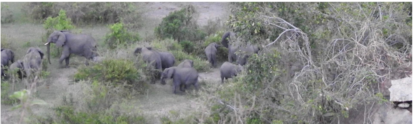
Figure 4: part of a herd of fifty elephants in the village as a villager tries to drive them back into the reserve.

Once an elephant herd enters a field they eat all the crops in a few hours. After such an incident, residents suffer food shortages and out of necessity they have to spend less on things such as their children's education or on medical expenses, and prioritize food purchases. Indeed, villagers' quality of life significantly deteriorates because of the elephant raids. Moreover, encounters with the elephants can sometimes be deadly—in 2015, four people were killed in the district. Under these circumstances it is understandable that villagers see the elephants as a threat (Figure 4). Human-elephant conflict is complex. Tanzanian law strictly protects elephants, while villagers seek to protect their crops by driving the elephants from their fields and risking their lives in such efforts (elephants are 4-5 meters tall and weigh as much as 6-7 tons).