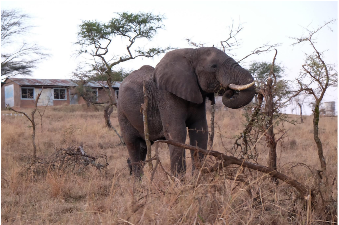
Figure 3: an elephant in Village A, Serengeti District

Even though they don't benefit from wildlife tourism, most of the residents in Serengeti District are affected by what may be termed the unintended side-effects of tourism and wildlife protection. The experience in Village A, my research site, is a case in point. Village A shares an eight-kilometre border with Ikorongo Game Reserve, which is adjacent to the Serengeti National Park (see Figure 2). Since there are no fences, all animals, including elephants, can move freely between the Game Reserve, the National Park, and the village (Figure 3).