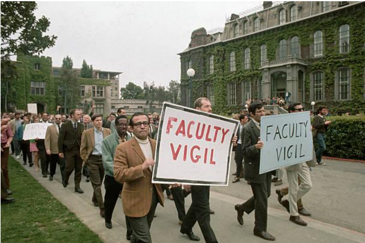
UC Berkeley faculty demonstration in support of student protests against closure of People's Park, 1969.

America, said the poet, is home to 'the best and the worst'. Where is the America of the New Deal, the Weavers, the 1960s movements that inspired the world, civil rights, women's, students, anti-war? Most have been gobbled up by forty years of free market wonder. 'For profit' institutions (healthcare, hospitals, prisons) without restraint is a slim foundation for social life but it does keep you busy. The Green New Deal is a beacon on the horizon.