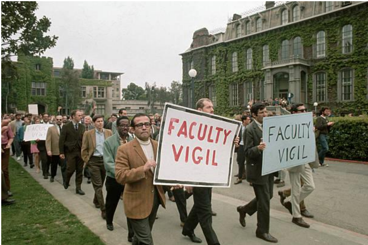
UC Berkeley faculty demonstration in support of student protests against closure of People's Park, 1969.

America, said the poet, is home to 'the best and the worst'. Where is the America of the New Deal, the Weavers, the 1960s movements that inspired the world, civil rights, women's, students, anti-war? Most have been gobbled up by forty years of free market wonder. 'For profit' institutions (healthcare, hospitals, prisons) without restraint is a slim foundation for social life but it does keep you busy. The Green New Deal is a beacon on the horizon.