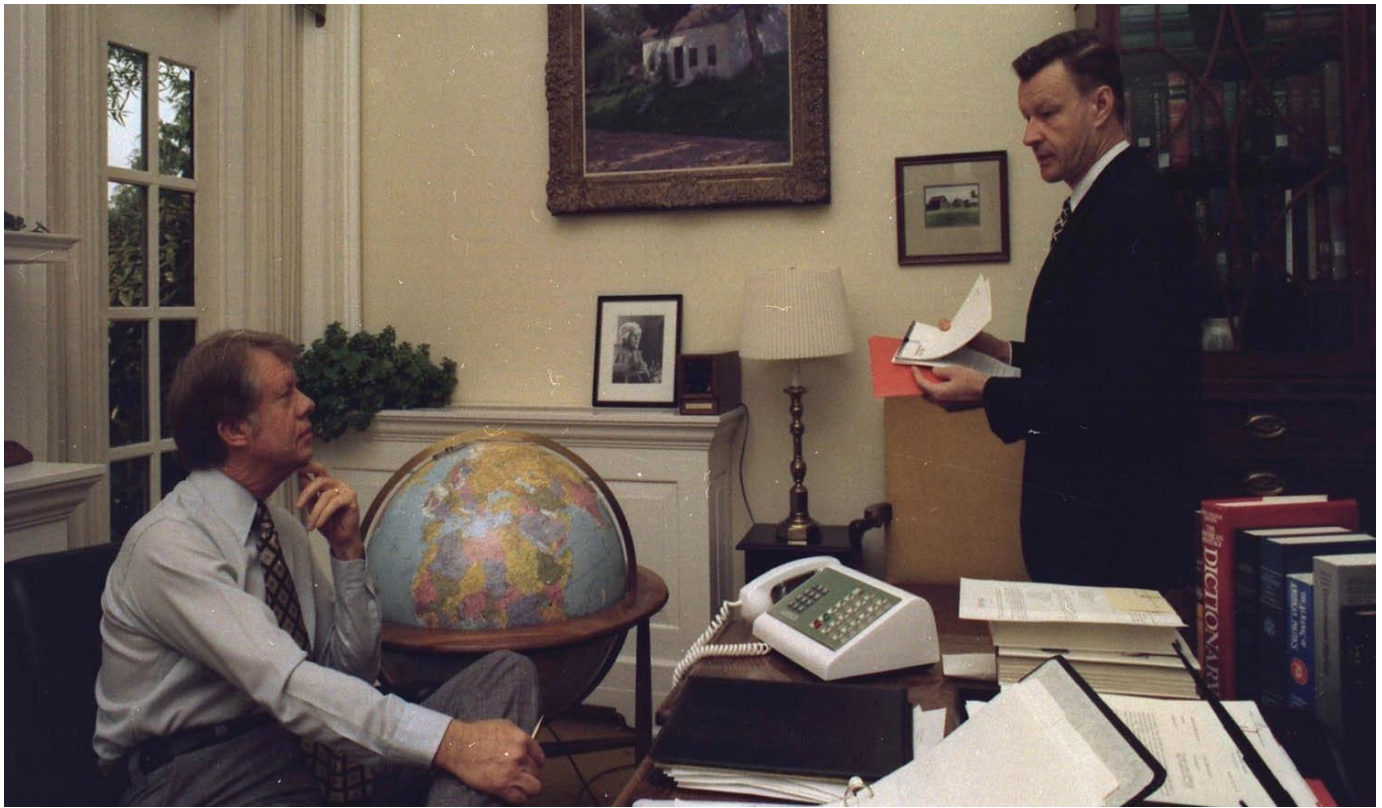
US President Jimmy Carter and National Security Advisor Zbigniew Brzezinski.

The driving force is not based on presidents' intentions, the influence of hawks and doves, nor the "deep state," but the underlying and material matrix that is imperialism as a system—of which the deep state, the hawks and doves, the neoconservatives and the neoliberals, are superstructures, "bearers" and epiphenomena.