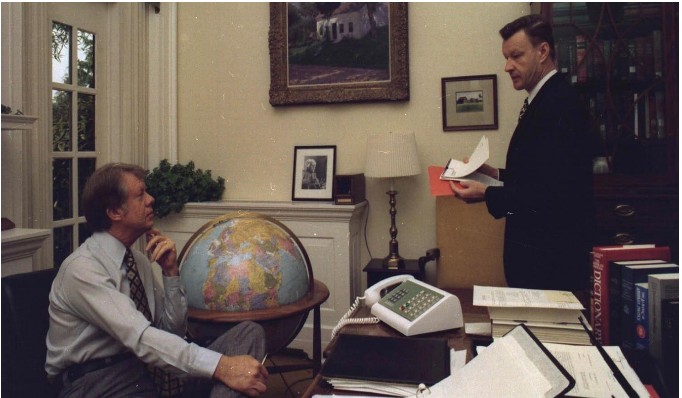
US President Jimmy Carter and National Security Advisor Zbigniew Brzezinski.

The driving force is not based on presidents' intentions, the influence of hawks and doves, nor the "deep state," but the underlying and material matrix that is imperialism as a system—of which the deep state, the hawks and doves, the neoconservatives and the neoliberals, are superstructures, "bearers" and epiphenomena.