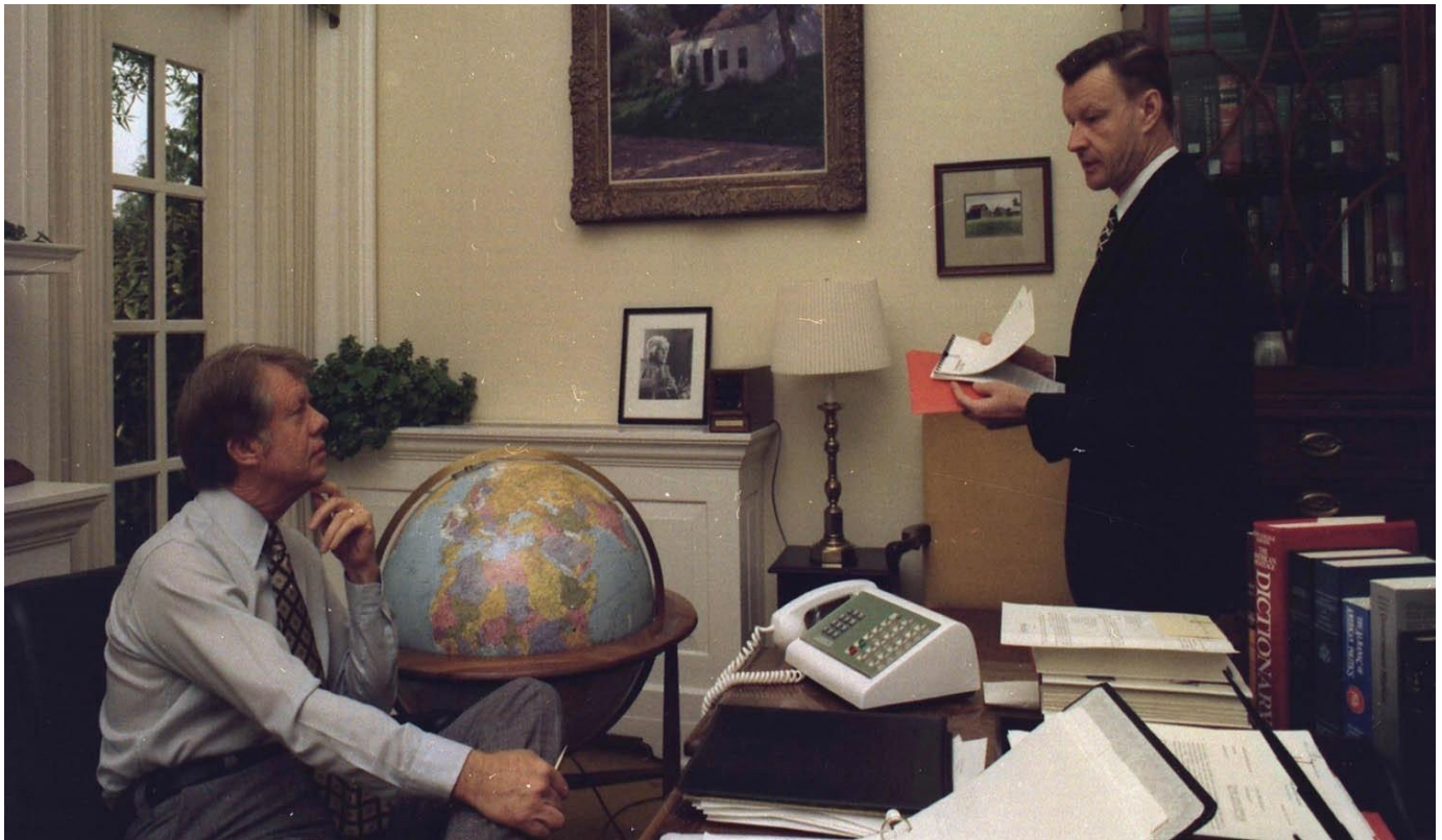
US President Jimmy Carter and National Security Advisor Zbigniew Brzezinski.

The driving force is not based on presidents' intentions, the influence of hawks and doves, nor the "deep state," but the underlying and material matrix that is imperialism as a system—of which the deep state, the hawks and doves, the neoconservatives and the neoliberals, are superstructures, "bearers" and epiphenomena.