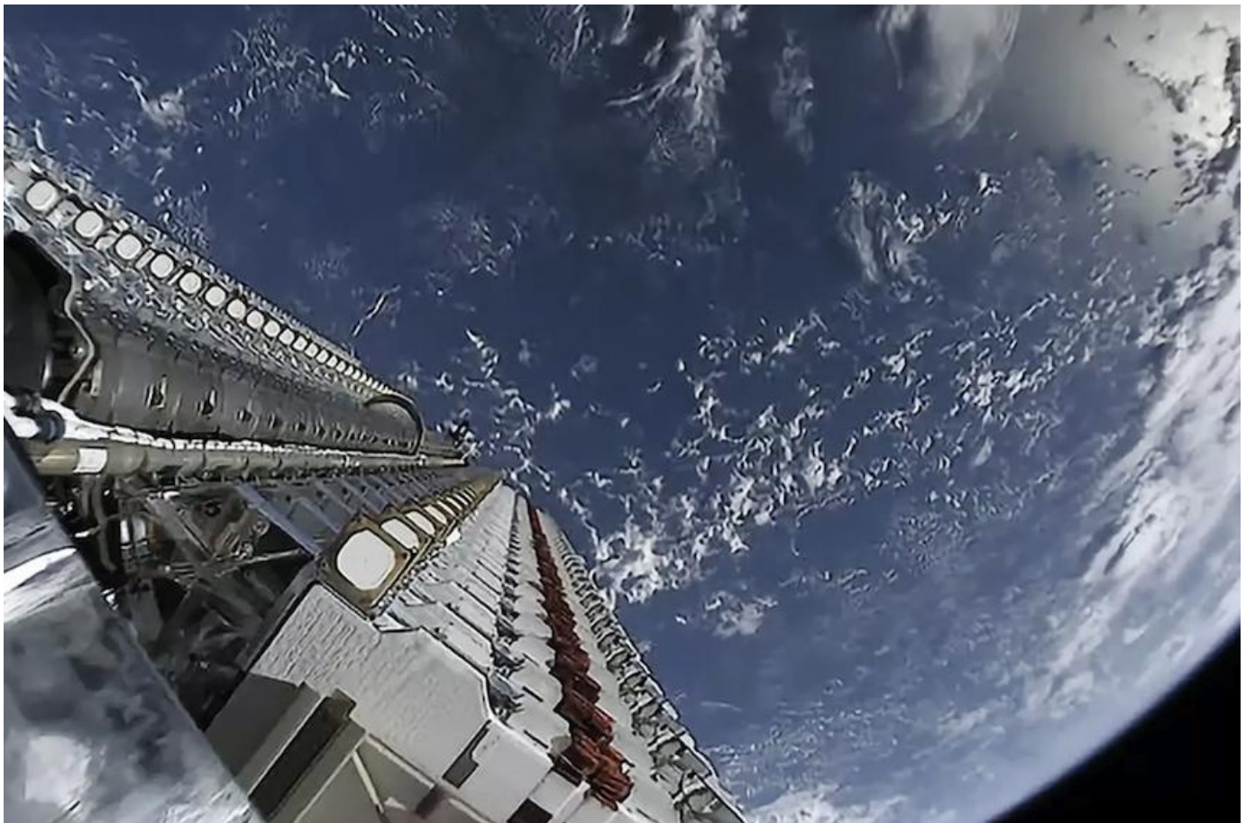
Screen grab of live footage from SpaceX's deployment of its first 60 Starlink broadband internet satellites on May 24, 2019.

Six decades ago, hard law international treaties established a regulatory framework for the few governmental space programs funded and operated by the Soviet Union, the United States, and European governments. Today, non-governmental commercial space companies are operating under voluntary soft law rules of the road that expose the deficiencies of the original treaties to empower regulatory supervision of the expanding commercial orbital presence. Technical solutions to space debris require a “sustainable” system of governance accomplished by increasing the costs of non-compliance by all entities, governmental and commercial alike.