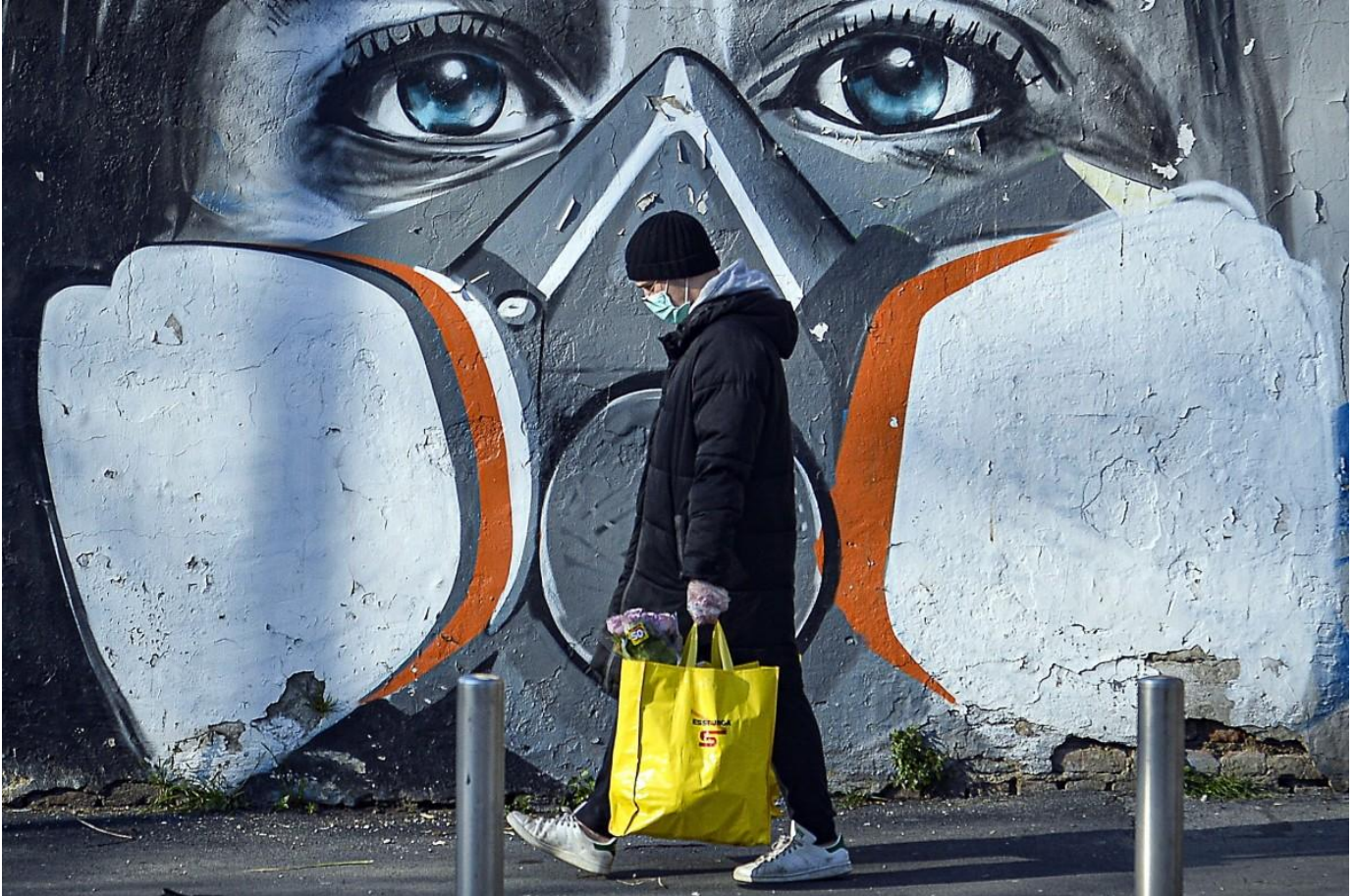
A man walks with his groceries past a coronavirus-inspired mural in Milan, Italy.

In South Korea, the outbreak in a church in Daegu in late February led to a miles-long queue of people seeking masks. Korean health workers were soon in full protective gear as they provided coronavirus testing at newly set up drive-through stations. These governments emphasized public information and provided daily reports for confirmed cases, and traced down patients' close contacts and the routes of the virus's spread. 7 A government website in Hong Kong, for example, provided updates on infections and suspected cases along with other important information.